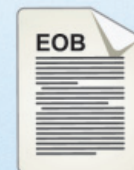
Explanation of benefits